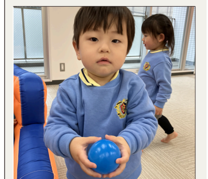
Shion Starfish Class