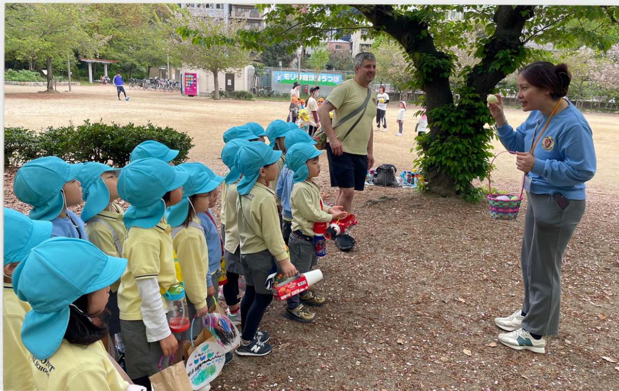
HFIS Easter Adventure