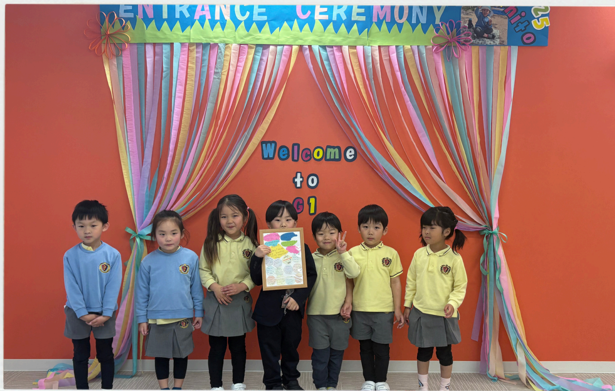
Grade 1 Entrance Ceremony